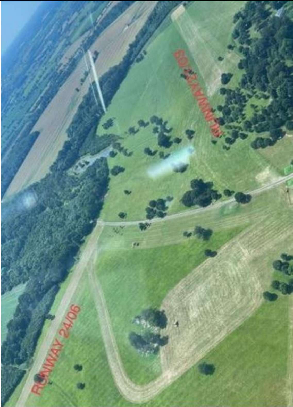
View of RWYs 21/03 and 24/06, turning base to Finals Rwy 21